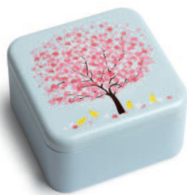
Tin box blue «Easter Tree»

Get inspired by our colourful Easter range, and find the perfect corporate gift. Whether it's one of our famous Bunny Nico in one of five flavours, or the small but delicious 'Easter tree' Tin box – we are convinced that together, we can find the perfect gift. Discover our latest corporate gifts, from our bunny-shaped bonbonnières to springtime gift boxes to Easter baskets and many other colourful treats made from the finest Swiss chocolate. The business customer team will be happy to advise you.