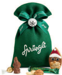
Santa's Sack in two different sizes