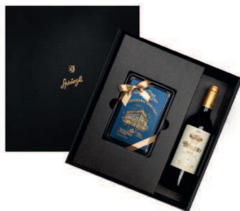
Gift sets in different variations