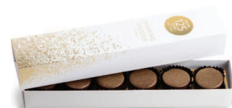
Your personalized Anniversary box