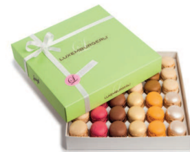
Luxemburgerli gift set in different sizes