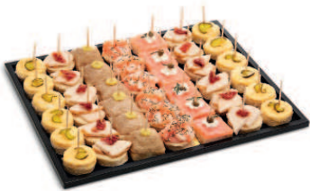
Arranged Apéro Plates

Our French croissants and classic truffle brioche are the ideal pastries for morning meetings. For business lunches, our bread is topped with fine spreads, varied ingredients and fresh vegetables to create truly tasty sandwiches. Our range, whether salads, sandwiches or Bircher muesli, is adapted to suit the season. Treat your employees, customers or business partners to true freshness and variety.