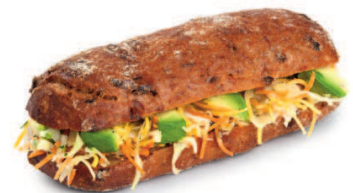
Seasonally changing Sandwich creations