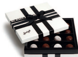
Blanc et Noir Truffles, refined with finest Perrier Jouët Champagne