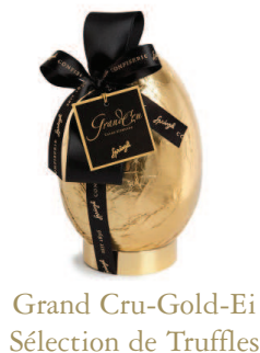
Grand Cru-Gold-Ei Sélection de Truffles