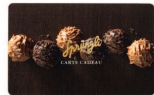
Sprüngli Gift Card