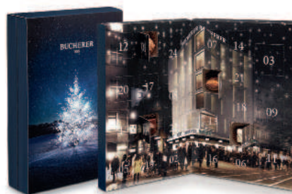
Individualized Advent Calendar