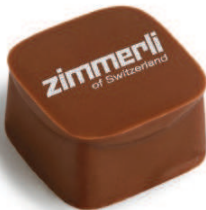
Screen printed pralines