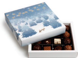
Box «Winter morning»