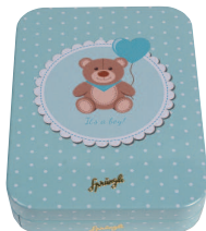
Tin box Baby Boy or Baby Girl