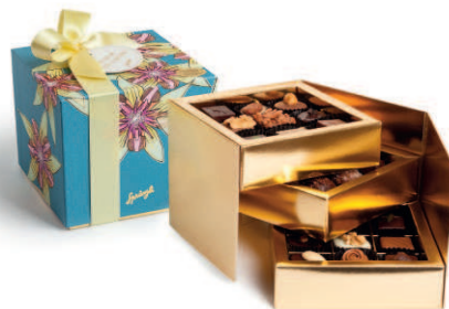
Cube available in various sujets