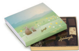
Box «Easter morning»