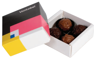
Personalized pralines box

The finest cake creations and gifts made from exquisite chocolate make a splendid birthday surprise. Congratulate your employees, customers or business partners on their special day with a unique surprise. A gift from Confiserie Sprüngli means they can enjoy a little indulgence on their birthday. Or if you're looking for a gift for new families, we've got the perfect ideas. Give new parents a creation from the House of Sprüngli.