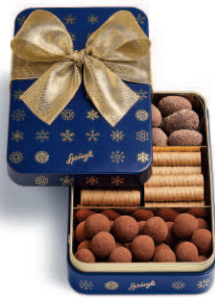
Tin box «Variété»

This Christmas, give the gift of festive indulgence in the form of the finest chocolate, delicate gingerbread, or sweet treats in an elegant box made from real wood. Delicious delicacies and flavours that bring back wonderful memories – that's what Christmas feels like. We have turned our traditional chocolate-making skills to the creation of festive delights, using the finest ingredients and exquisite craftsmanship to produce true delicacies. We would be happy to help you create unforgettable moments of indulgence for your employees, customers and business partners.