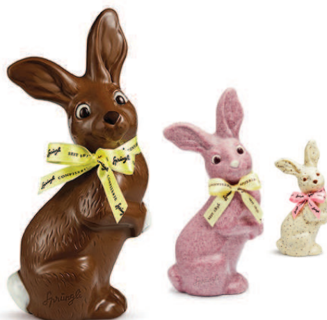
Bunny Nico milk in four sizes